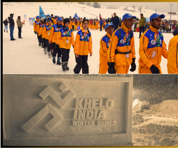
Khelo India Winter Games at Gulmarg

“Sports inspire excellence, discipline and team work”