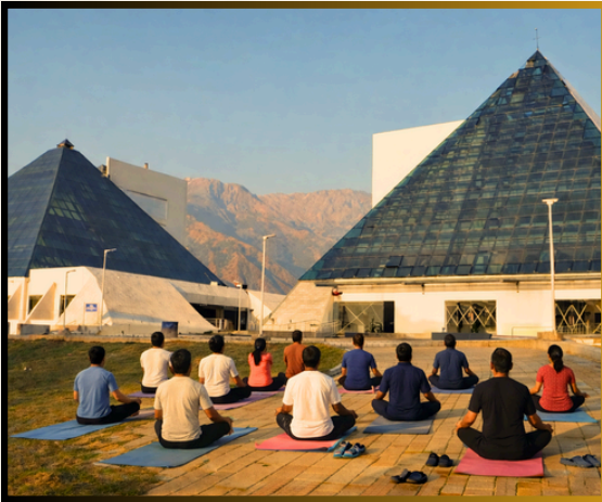
Mantalai International Yoga Centre, Udhampur